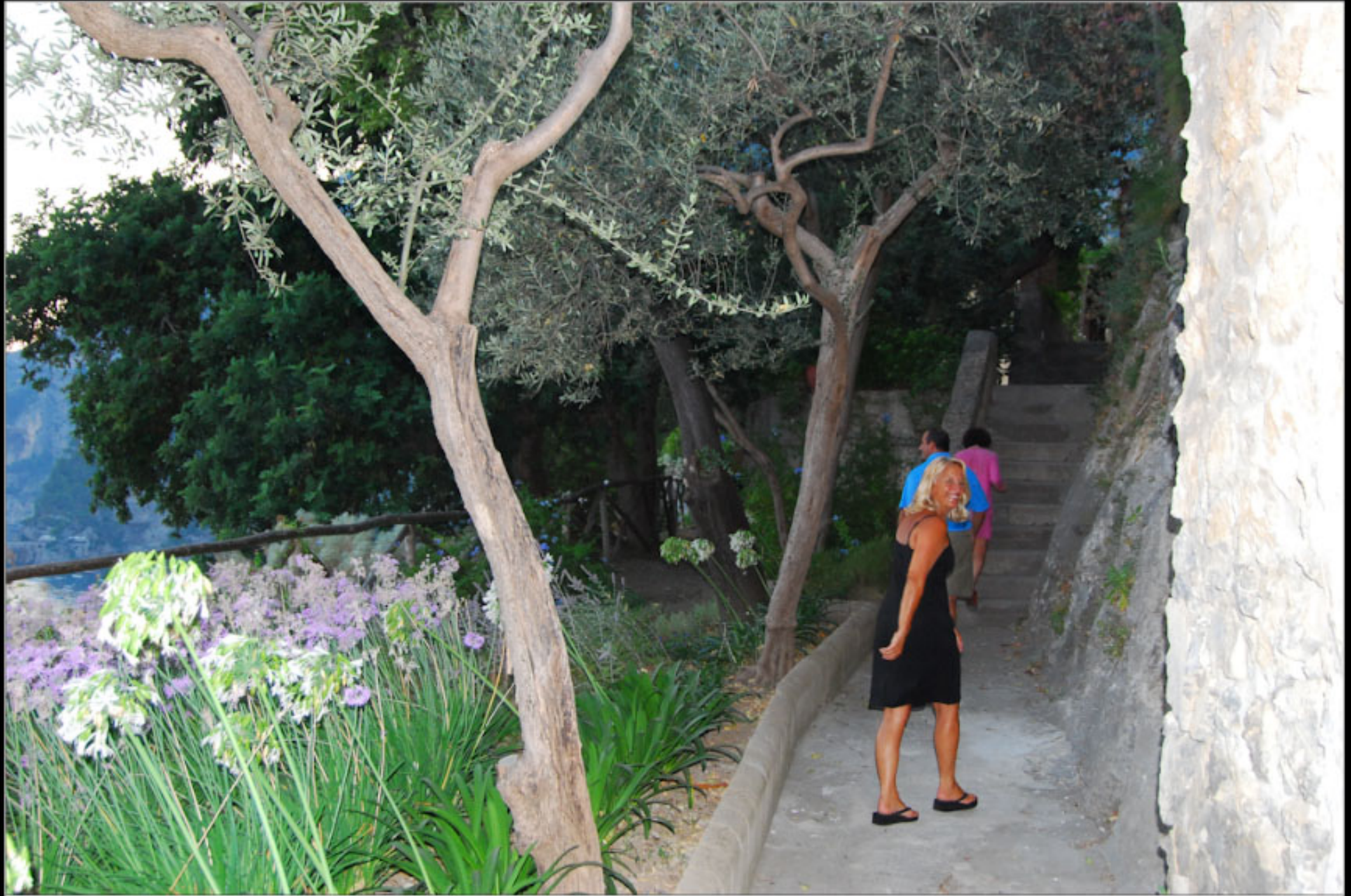
"Walking up path to Homera's house."