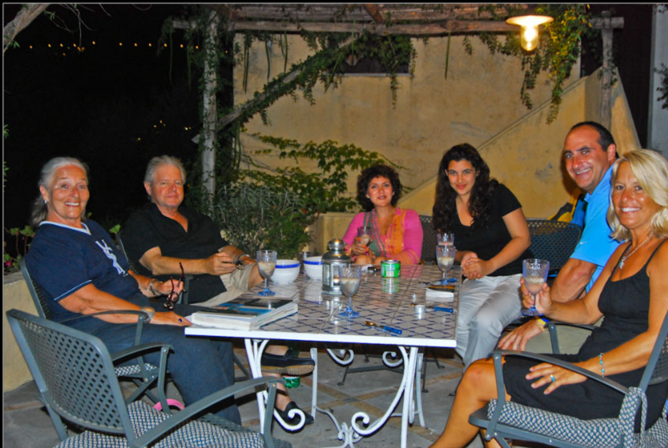
"New friends in Positano."