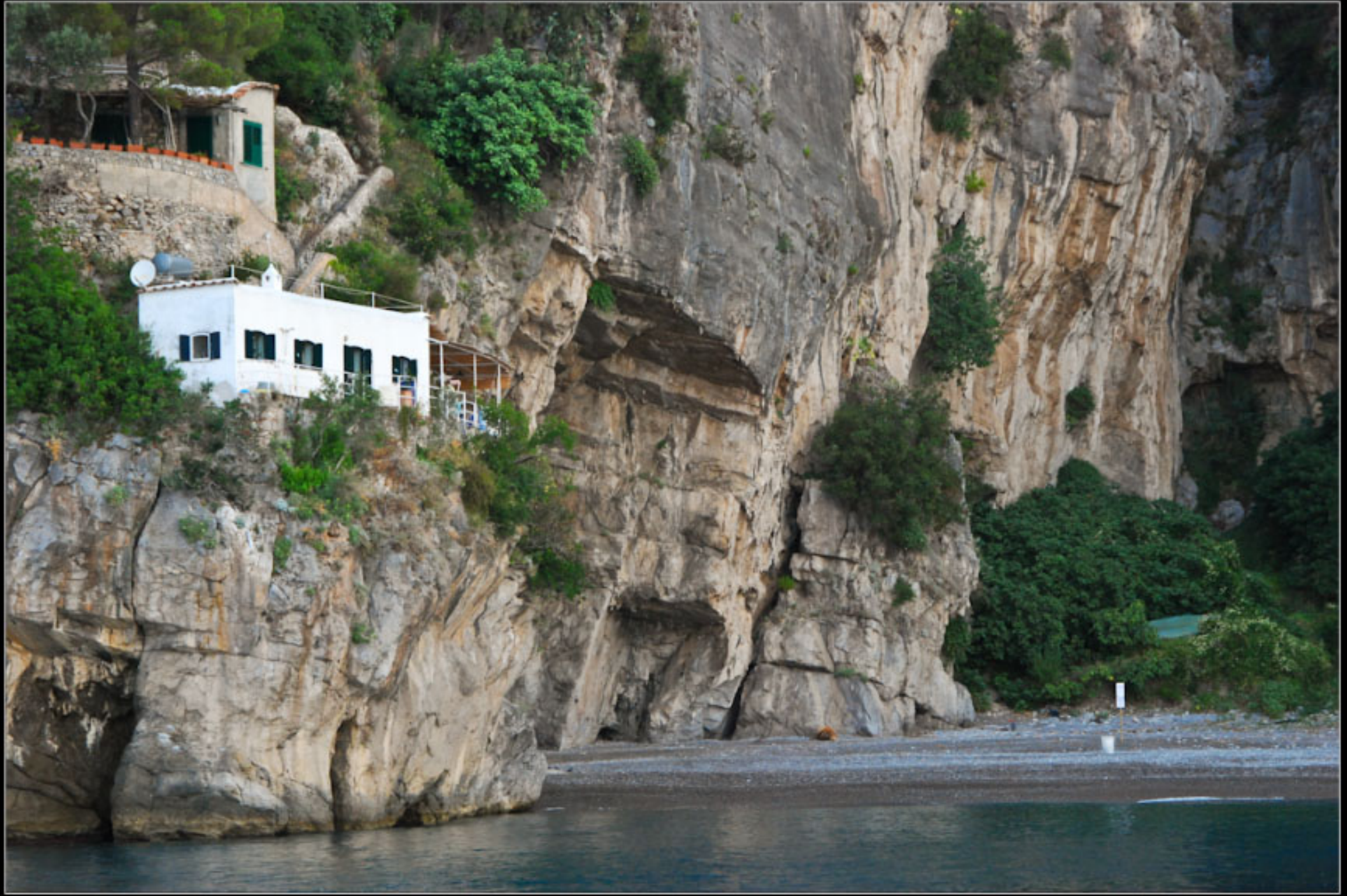
"Raimonda's house on left (white)."