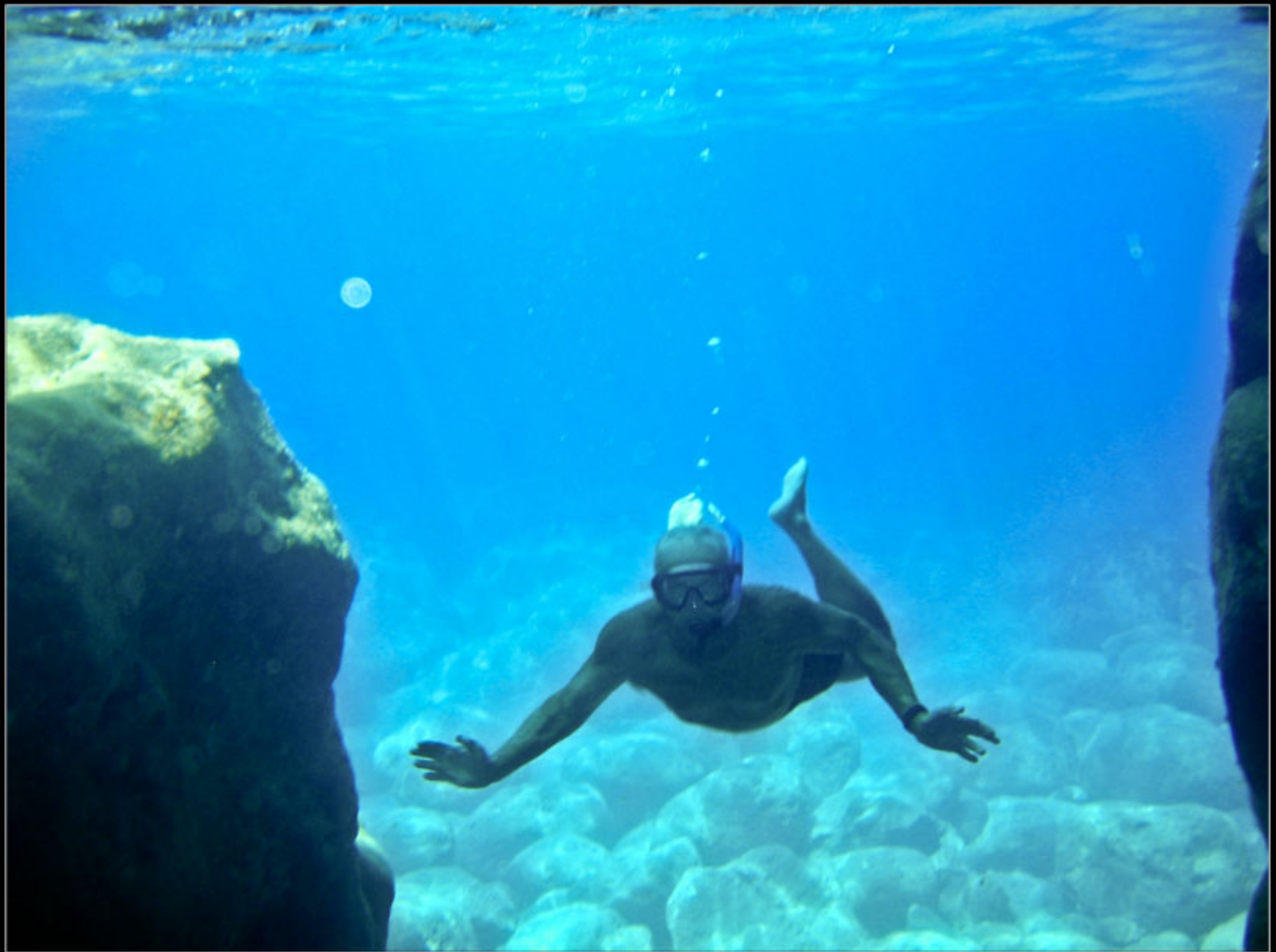
"Lipari - cove at Valle Muria"