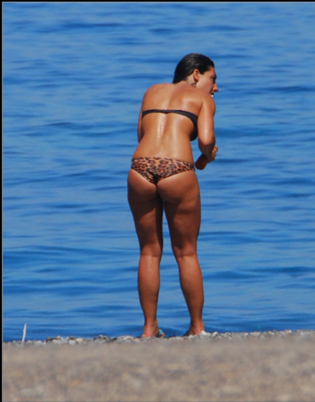
"Beach at Canneto, Lipari."