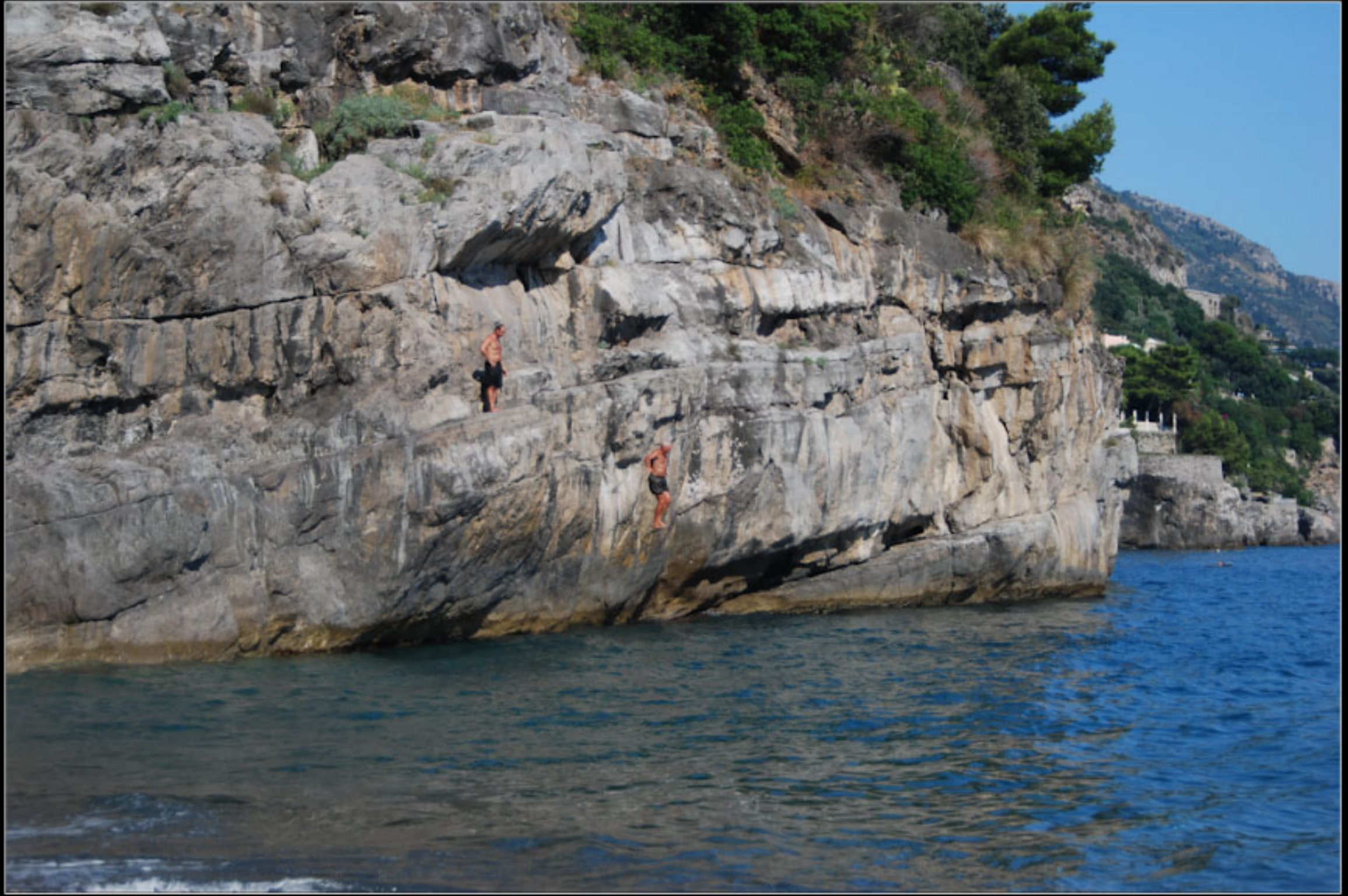
"Jumping from cliff in Positano"