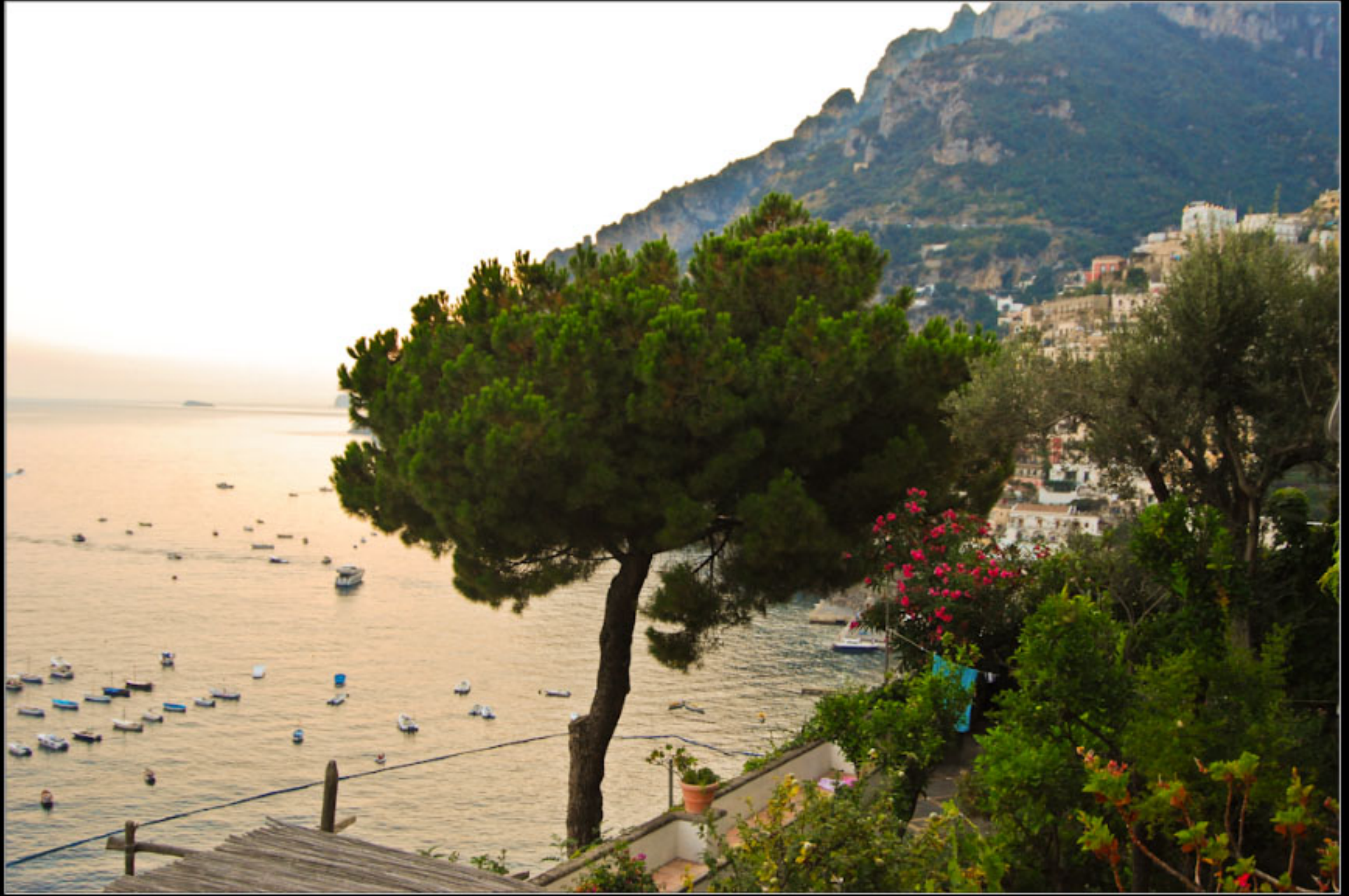
"View from Homera's house."