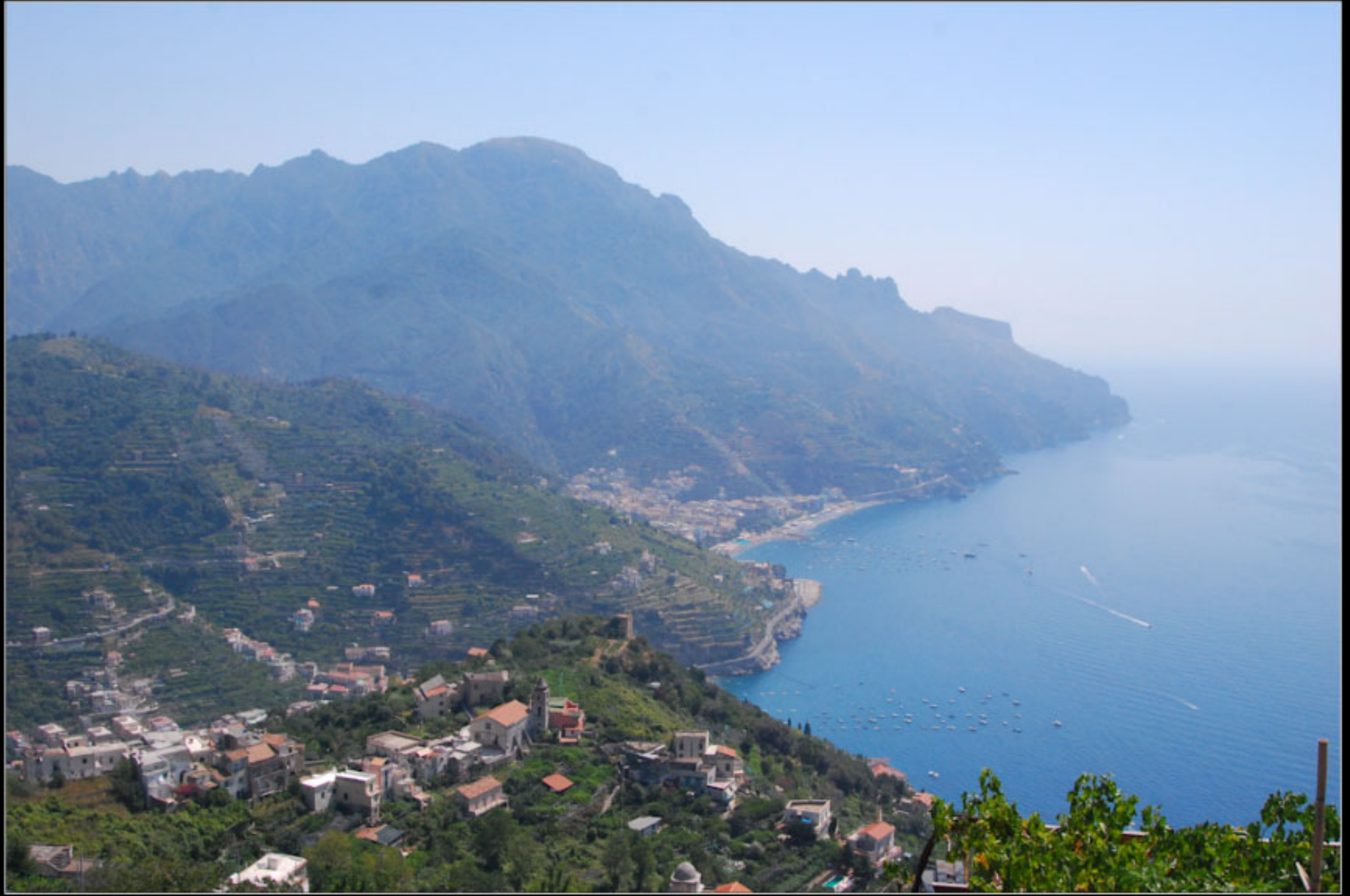
"View from Ravello"