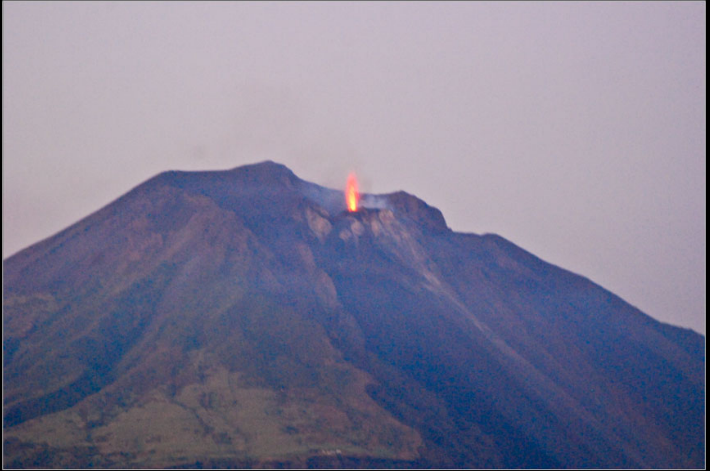
"Stromboli, active volcano in Aeolian Islands."