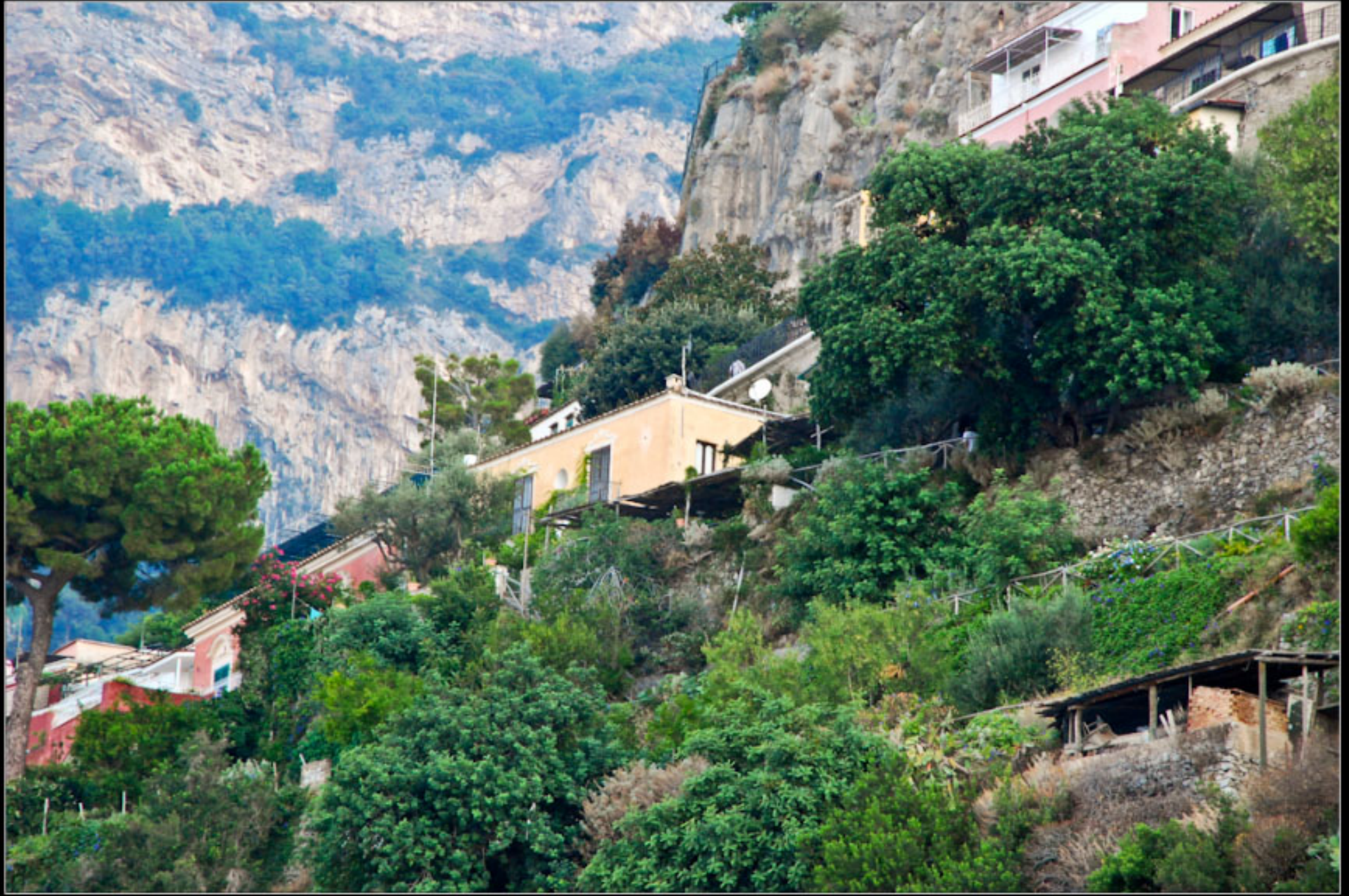
"Homera's house (yellow)."