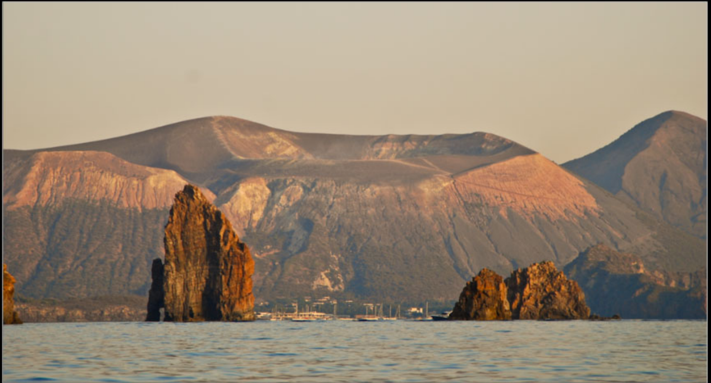
"Active crater on Isola Vulcano as seen from Lipari."