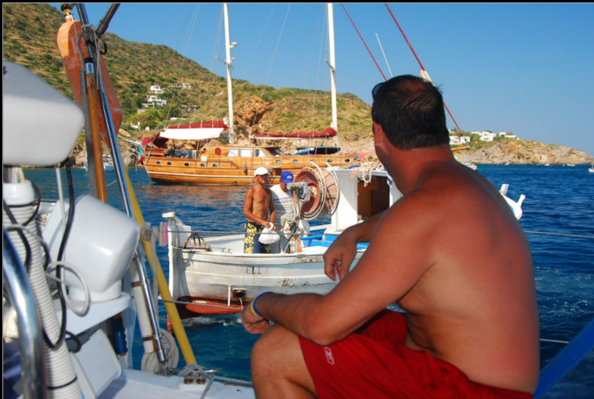
"Buying fish from a local at Salina."